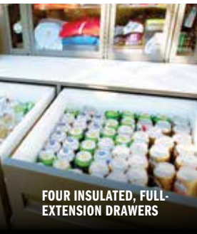
FOUR INSULATED, FULL- EXTENSION DRAWERS