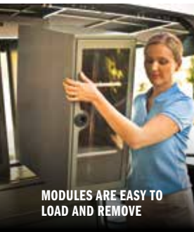
MODULES ARE EASY TO LOAD AND REMOVE