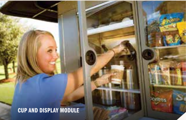
CUP AND DISPLAY MODULE