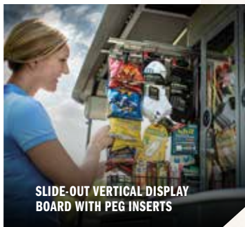
SLIDE-OUT VERTICAL DISPLAY BOARD WITH PEG INSERTS